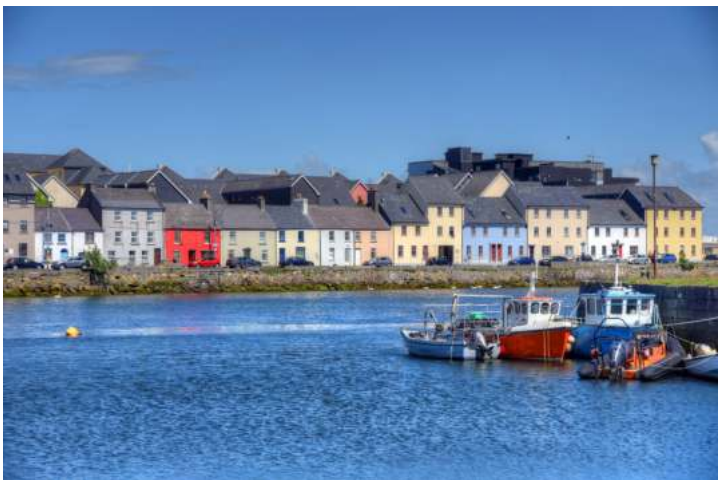
Day 2 | To Galway, City of the Tribes

Leave Dublin and set off through the delightful landscapes of the Emerald Isle. Cross Ireland's longest river, the river Shannon, to reach historic Galway, the City of the Tribes, at the mouth of the Corrib River. Easily one of Ireland's most fun and lively cities, the streets are lined with buskers, the region is known for its famous oysters and the pubs are full of Irish charm. Join your Travel Director to see the Church of St. Nicholas, where Christopher Columbus reputedly prayed before setting off for his discovery of America. Also see the pre-medieval Spanish Arch and Eyre Square, dedicated to the late US President, John F. Kennedy.